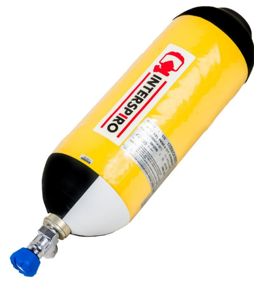
Full composite - 9.0 L