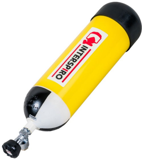
Steel cylinder - 6.0 L