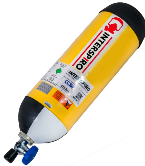
Full composite - 6.8 L